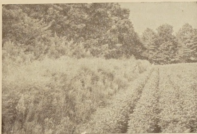
This wildlife border is a living symbol of better land use.

Contains Bicolor and Scarified Sericea Lespedezas